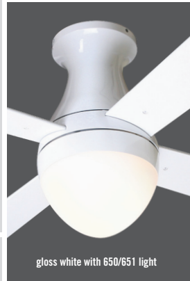
gloss white with 650/651 light