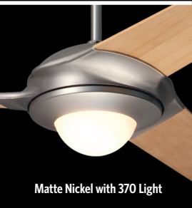
Matte Nickel with 370 Light