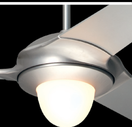
Matte Nickel with 371 Light